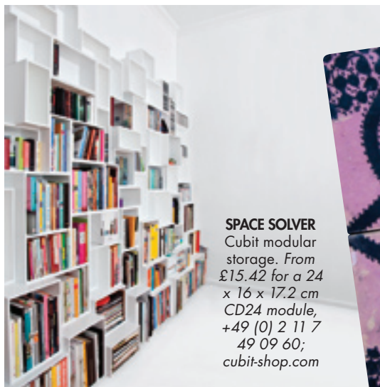
SPACE SOLVER Cubit modular storage. From £15.42 for a 24 x 16 x 17.2 cm CD24 module, +49 (0) 2 11 7 49 09 60; cubit-shop.com